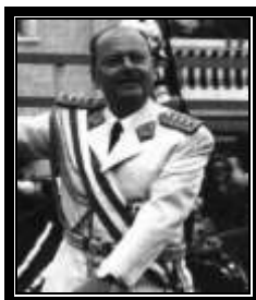
General Juan Velasco Alvarado President of Perú 1968-1975

In 1968 he was overthrown by the architect Fernando Belaunde Terry in a coup led by his aide, General Juan Velasco Alvarado, who rule the country until 1975 causing a revolution in our economy and create this new issue.