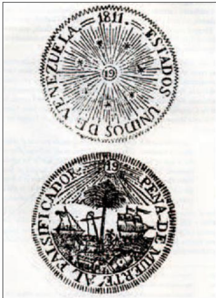
Seals used on the first republican paper money issue in Venezuela.

During this time, many counterfeits appeared and the government was forced to issue new bills with the legend “ Pena de Muerte al Falsificador ” (Death Penalty to the Counterfeiter) but the warning did not have much effect. The republican paper money was unpopular. Venezuelan humor made jokes of this situation. The historian Pedro Grases gathered these examples: “ Roscio, Blandin and Tovar were equivalent to sota, horse and king, in the deck and the game of golf ”. Other phrases: “ I sell a Roscio or the three reunited ” or “ If Roscio evicts me, Blandin shrouds me and Tovar buried me. ”