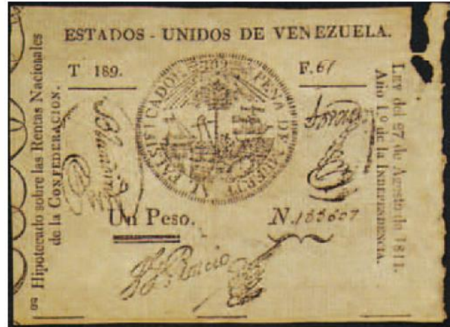
A 1 peso note from the first issue by republican Venezuela (P4).

suggested the issue of some bank notes of 2 reales, and 1, 2, 4, 8 and 16 Pesos. On November 18, 1811 these notes were put into circulation but with the emission date of Law of August 27, 1811.