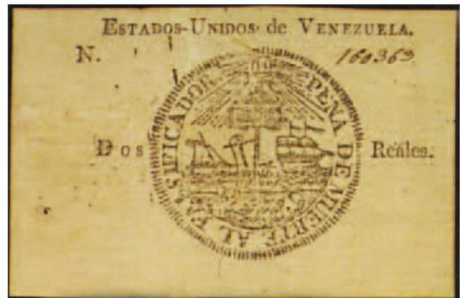
A 2 reales issued by the republican government of Venezuela (P2).

Most of those early bills were uniface (except the 2 reales) and printed in black on heavy white paper. Preparing the first issue for all denominations required about 350 reams of paper, costing about 2,000 pesos. Initially, the bills were printed on sealed paper from Cataluña, Spain, as can be seen on the backs of several copies of the notes of the first issue. Later this white paper came from a number of other countries, namely England, France, Italy, the Netherlands and the United States (specifically from Philadelphia and New York). Over three different emissions the quality of paper was decreasing.