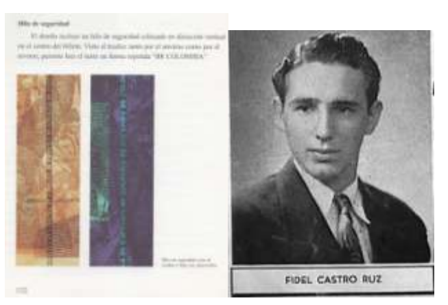
On 1950, he graduated with a Diplomatics Rights & Laws..

There is no explanation for this 'Fidel' that appears on the back of the banknote. On the new banknote presentation brochure, by Banco de la República, page 12. Fidel appears on the banknote's back facing right.