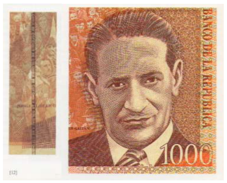
Gaitán drawing based on a picture by Sady González at the Nutibara Hotel, Medellín.

There is no explanation for this 'Fidel' that appears on the back of the banknote. On the new banknote presentation brochure, by Banco de la República, page 12. Fidel appears on the banknote's back facing right.