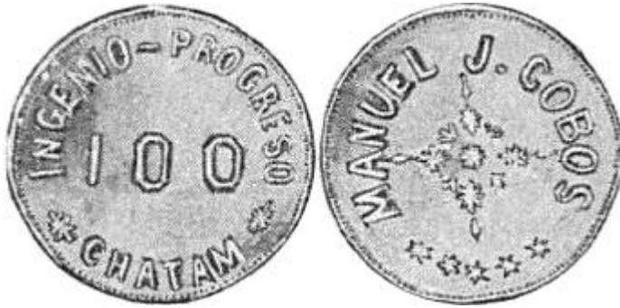
100 (Centavos) ND Copper