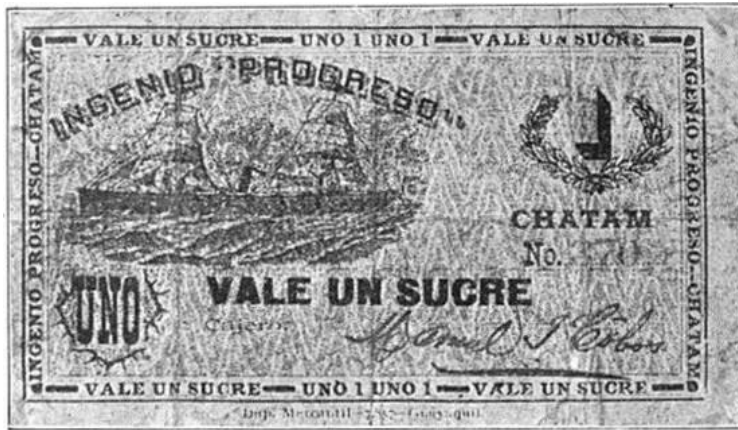
1 Sucre ND Scrip. I suspect this note was still in use in 1904 but have no proof of that.

5 Sucres ND Scrip. Reported by Latorre but there is no other confirmation in anything that I have seen.